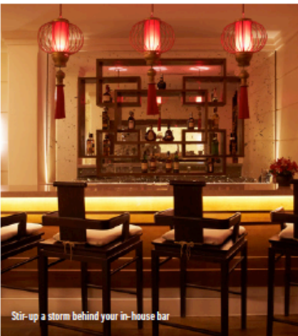
Stir-up a storm behind your in-house bar