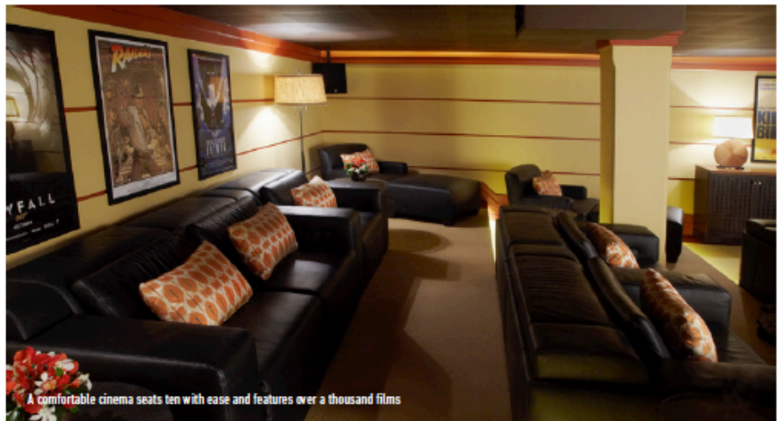
A comfortable cinema seats ten with ease and features over a thousand films