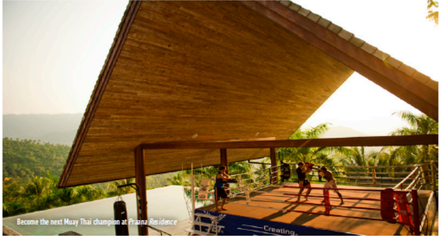
Become the next Muay Thai champion at Praana Residence