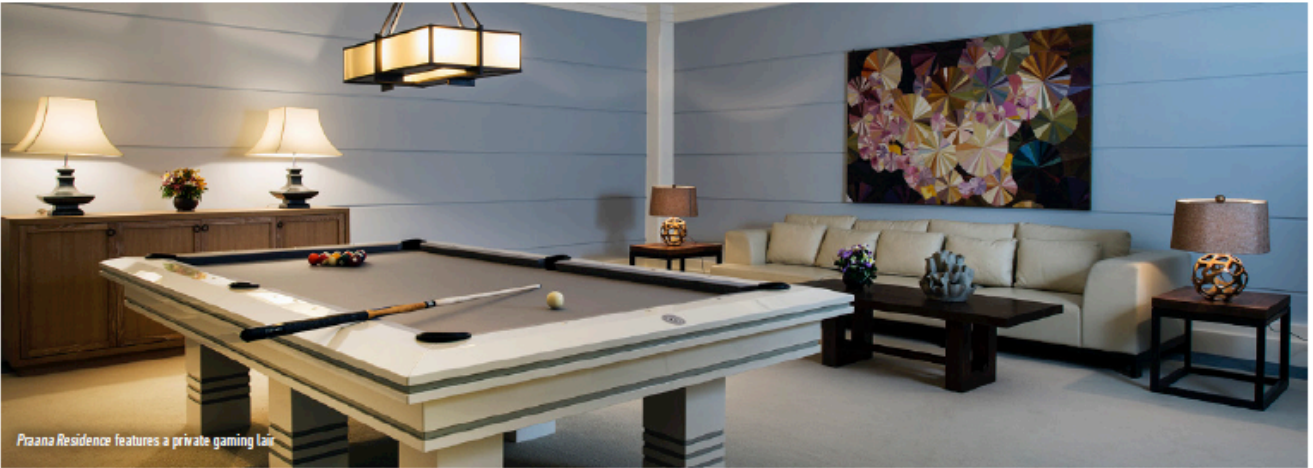
Praana Residence features a private gaming lair