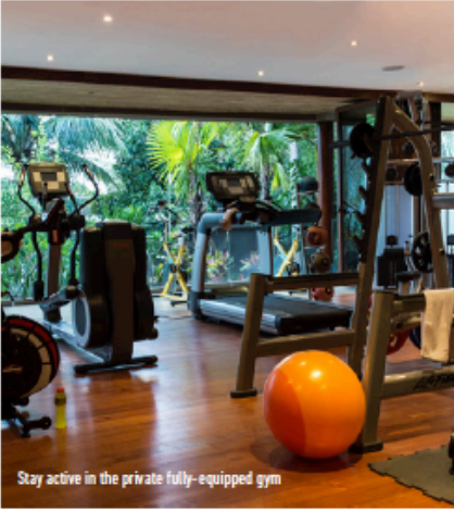
Stay active in the private fully-equipped gym