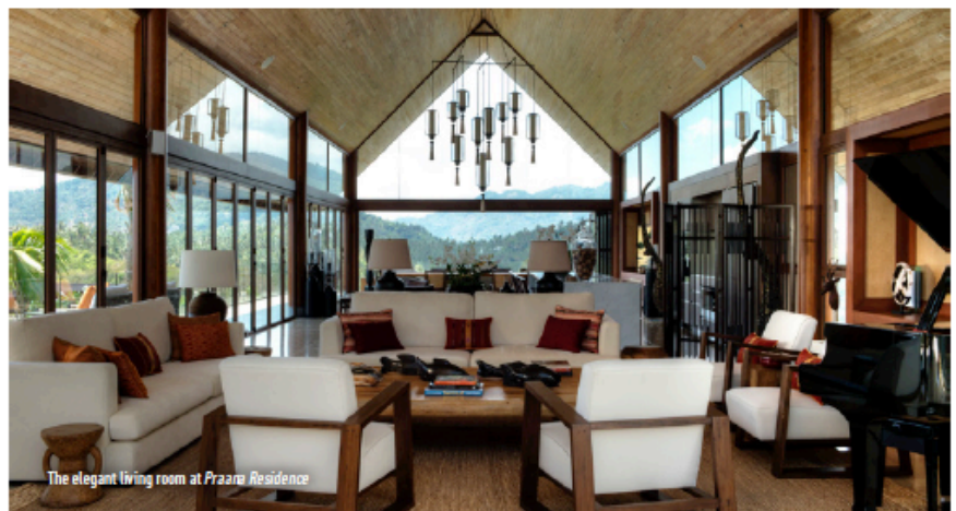
The elegant living room at Prazak Residence