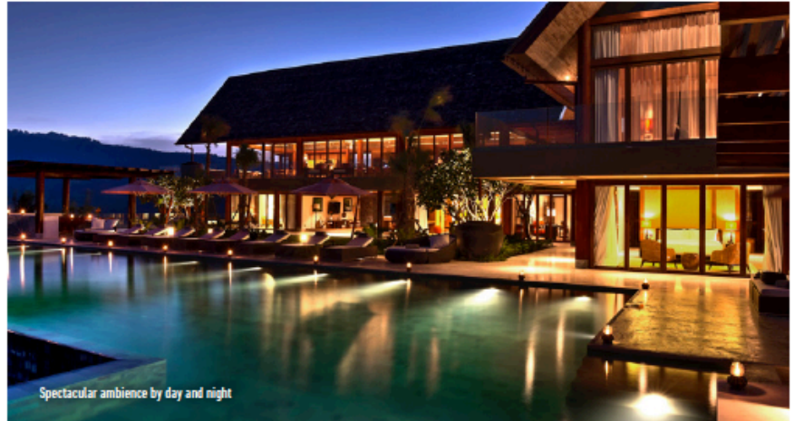
Spectacular ambience by day and night

The strategy was to achieve optimum levels of privacy throughout the site and, at the same time, give due respect to the unique topography of the island. Cedar shingle roofs enable the buildings to almost disappear into the hills, making the residences barely visible to onlookers. Guests can rest and enjoy their time at Panacea in the knowledge that they are completely