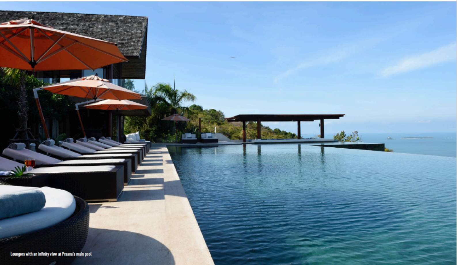
Loungers with an infinity view at Praana's main pool